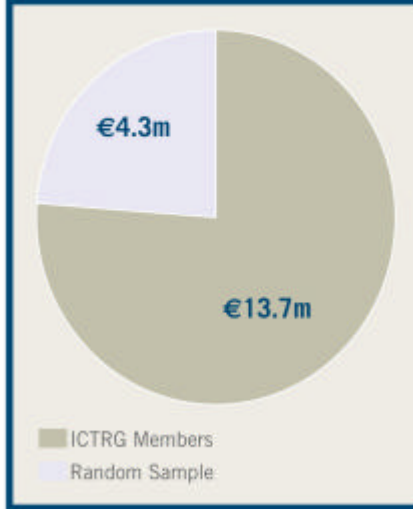
Figure 2 Total VAT Expenditure of sampled charities - 2001